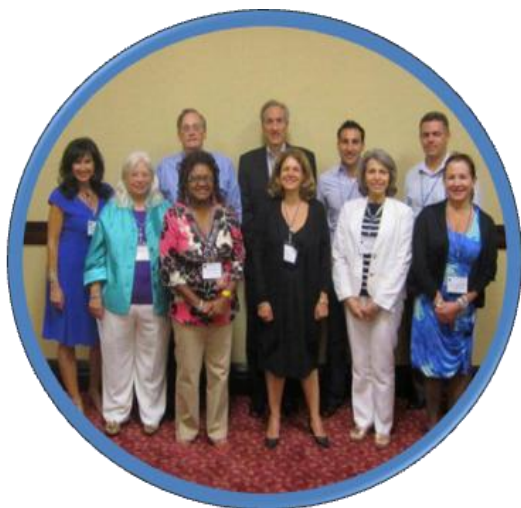
The Board of the KLS Foundation

Information about obtaining a video of the conference is available by clicking here .