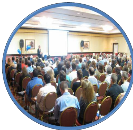
A full house at the KLS Conference