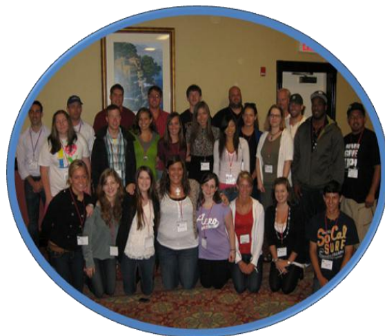
Some of the KLS patients at the first international KLS conference

The success of the First International KLS Conference ignited new and bigger dreams for the future of the KLS Foundation. We hope it will be the first of many successful worldwide